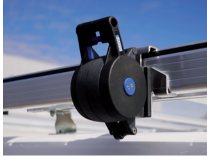
Belt retractor unit