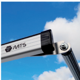
Compatible MTS rear door ladders